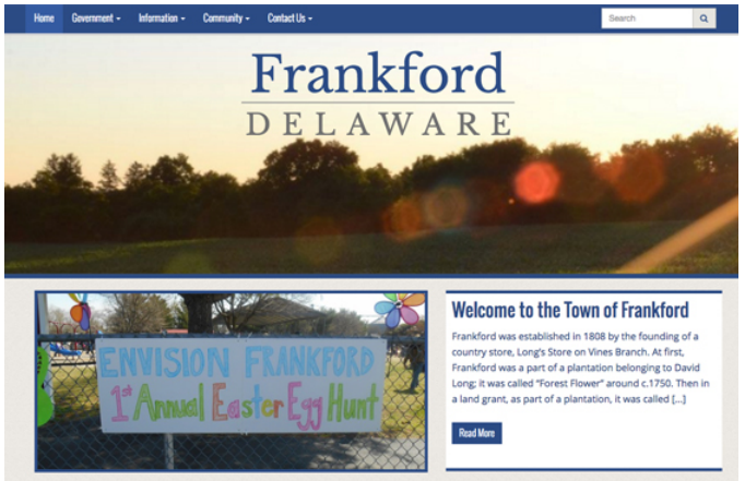
The Town of Frankford website is one of more than two dozen small municipal sites built by GIC.