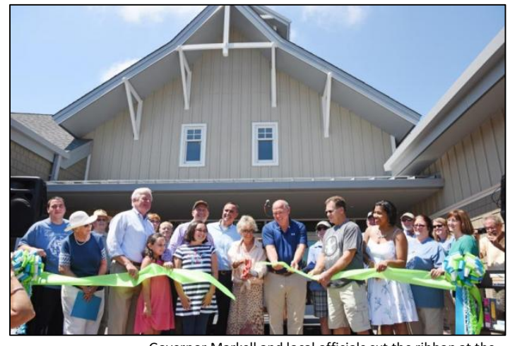
Governor Markell and local officials cut the ribbon at the new Lewes Library in June, 2016.

The Markell administration provided $44.6 million in state funding – more than any previous administration – for 16 library construction projects statewide including new libraries in Dover (2012) and Lewes (2016) and major renovations to the Wilmington library (2014). These projects increased available library space for collections, meeting rooms, and new technologies by 160,000 square feet or 38%.