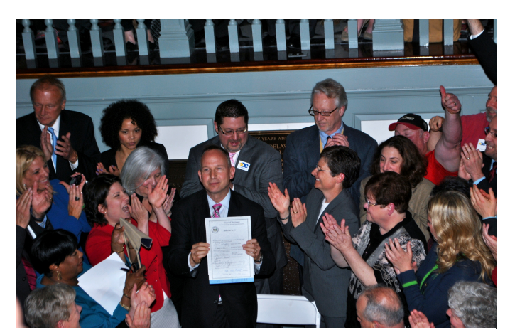
Governor Markell signed House Bill 75 into law moments after it cleared the General Assembly on May 7, 2013, establishing marriage equality.

(DHR) staff received and processed more than 300 fair housing complaints and more than 400 equal accommodations complaints, awarding thousands of dollars in monetary damages and mandating training programs for losing respondents.